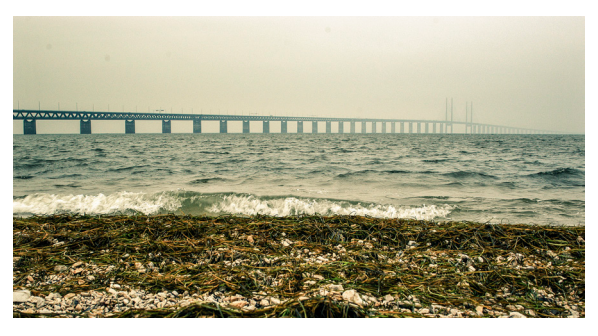
SWEDISH EFFORTS to minimise and address the impacts of ocean acidification focus on the implementation of SDG 14.3 through established environmental collaboration and naturally

Sweden now has the ambition of zero net-emissions of greenhouse gases by 2045 [8]. The Swedish Parliament has adopted 16 environmental quality objectives (EQO), describing what state and quality of the country's environment are sustainable in the long term. The Swedish parliamentary committee for environmental objectives has proposed new emissions targets and a new climate change strategy [9]. The Swedish Parliament ratified the Paris agreement in November 2016. The Swedish Government adopted a proposal for Sweden's first climate act on 2 February 2017. The act and new climate goals will give Sweden an ambitious, long-term and stable climate policy in line with the requirements of the Paris agreement. Provided a positive vote in parliament in June, the act will enter into force on the first of January 2018. The aim is to keep the global rise in temperature as far below 2 °C as possible, and to strive to limit it to 1.5 °C. The Swedish government's budget bill for 2017 is the largest environment and climate budget ever presented in Sweden, comprising investments for the climate of SEK 12.9 billion during 2017-2020.