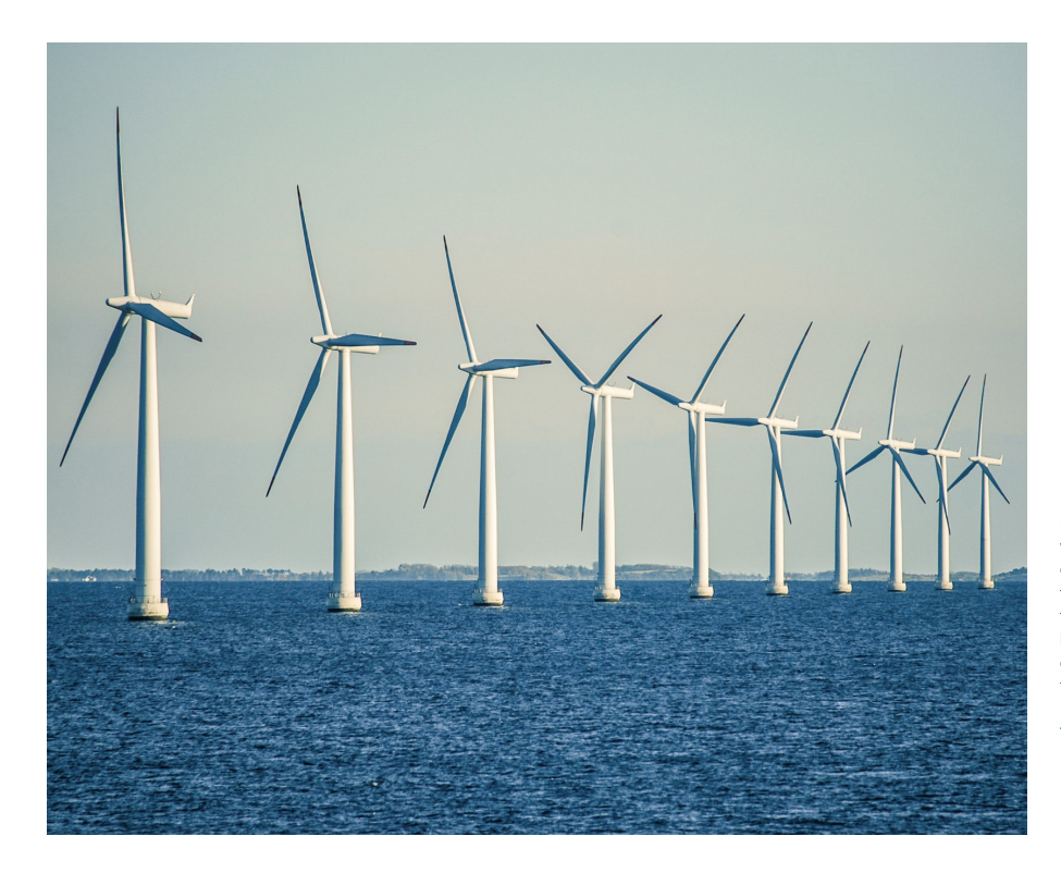
EMISSION REDUCTIONS in line with the Paris agreement will benefit the mitigation of both

climate change and ocean acidification. Shifting from fossil fuels to renewable energy sources is key. More than half of Sweden's energy production now comes from renewable sources.